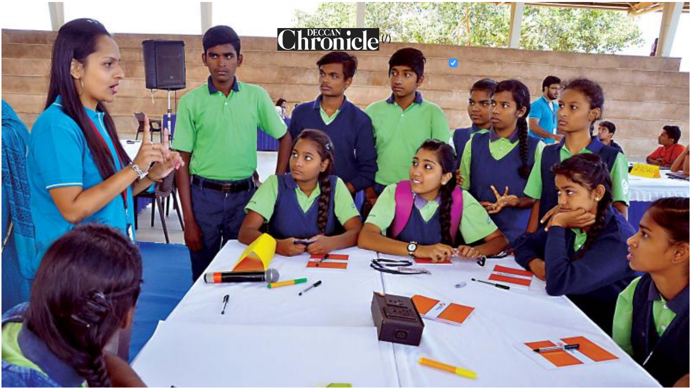
Students take part in the Changemaker Challenge at Inventure Academy, on Friday

Bengaluru: Students from different schools in the city got together at Inventure Academy on Friday and proposed solutions and prototypes to various socio-economic problems. The second edition of 'The Changemaker Challenge' saw teenagers representing different schools taking part in a competition focused on the importance of education in different walks of life.