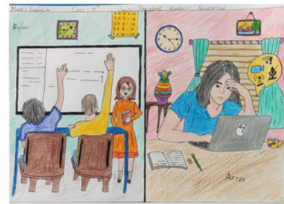
Name – Sindu Class - Pluto

Our children are constantly interacting with their peers from across India and internationally – recently, the girls from Inventure Academy held a storytelling and craft workshop for our students.