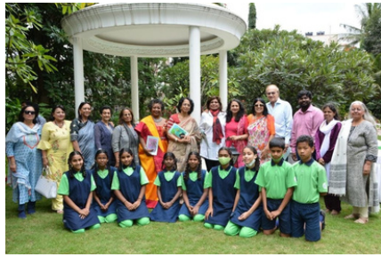
Parikrma children bagged first place in the essay competition held by Art Mantram